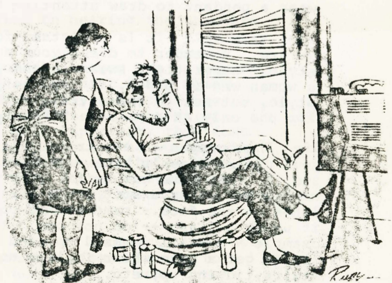
"You said knock off the TV bit and be a man!"