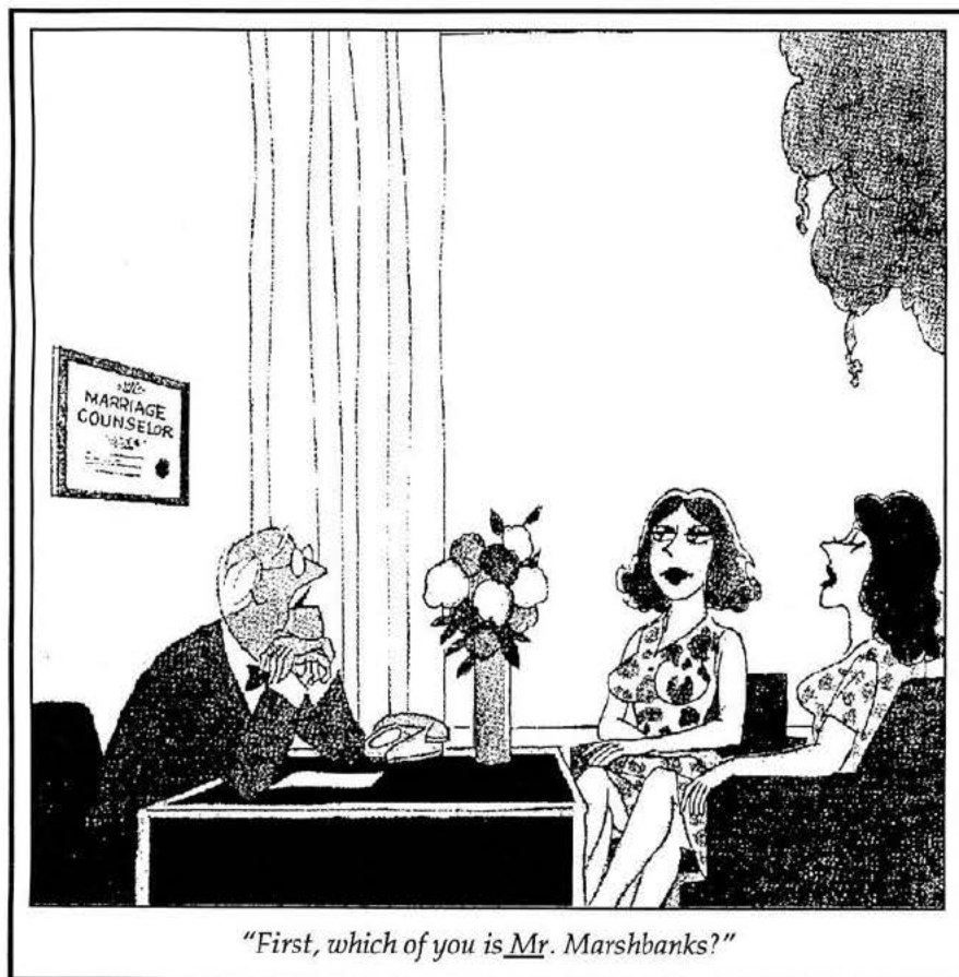
Reproduced by Special Permission of PLAYBOY Magazine: Copyright © 1988 by PLAYBOY