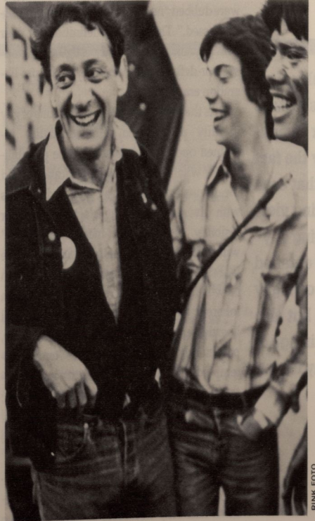
Harvey Milk, Castro Street Fair, 1978

The early activists inadvertently caused their own obsolescence. By aping the rhetoric and forms of the civil rights and women's movements, they helped gay activism win legitimacy first in left-wing and then in liberal circles. Within four years, advocating for gay rights (not liberation) became a respectable form of political activity in the left wing of the Democratic Party. In the mid-seventies, NGTF and the gay democratic clubs began to present opportunities for activism as a part-time activity. This increased participation in the movement overall, but also transformed the job description of movement leader from a selfsacrificing "new human" living the revolution to the more traditional model of administrator,