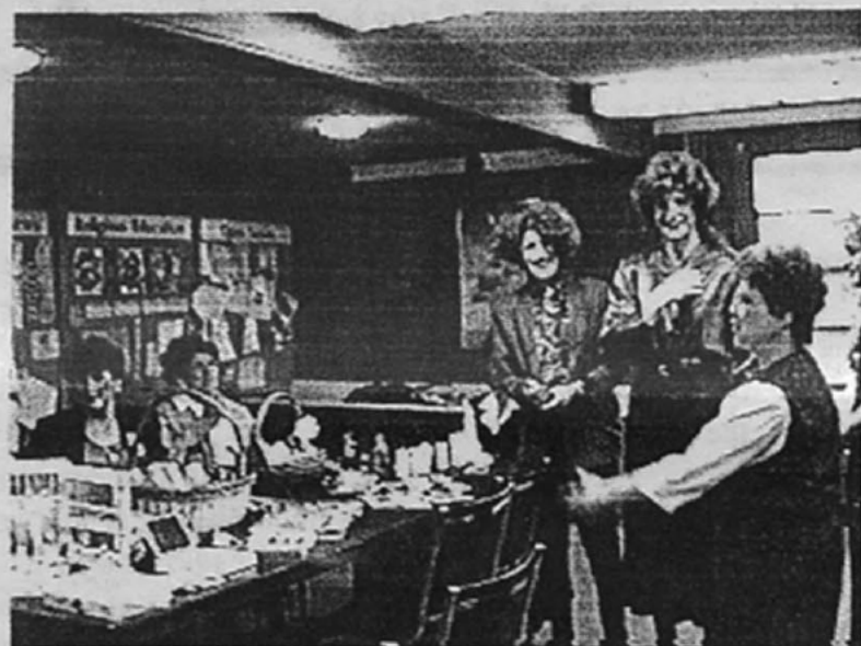
MARY KAY PRODUCTS ON DISPLAY