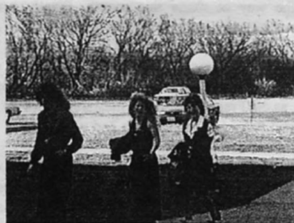
SOME OF OUR LADIES ARRIVING