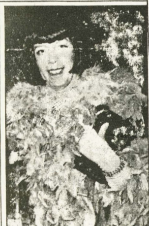
HI, WHAT SIGN ARE YA? Critic Kenneth Tynan explained he "just didn't feel like wearing an ordinary suit" and appeared at a London party wearing a dress.

The "bomb" turned out to be soap and an alarm clock.