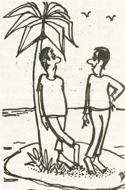
"I was on my way to Denmark for an operation. Where were you headed, Honey?"