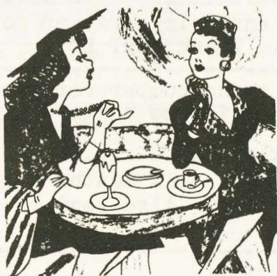
"—And, that's how I became a transvestist, how about you?"