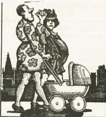
Voted in for unparalleled stupidity, a West German man who called birth-control pills a swindle because, though he took them for seven years, his wife had had six children. When told by doctors that the pill was for women, the man said: "But the directions on the box don't say that."