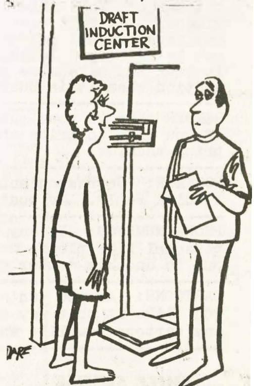
"I'm five feet seven— five feet nine in my high heel pumps."