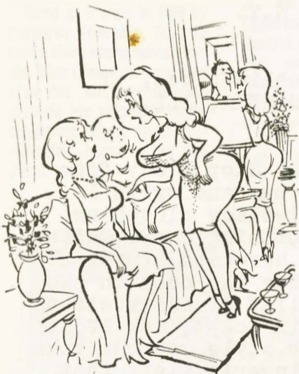
"Awful rumor going the rounds here! They're saying one of us girls really is!"