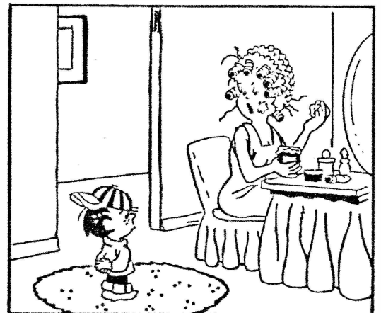
"What do you mean, I really have my work cut out for me before the Chapter meeting tonight?"