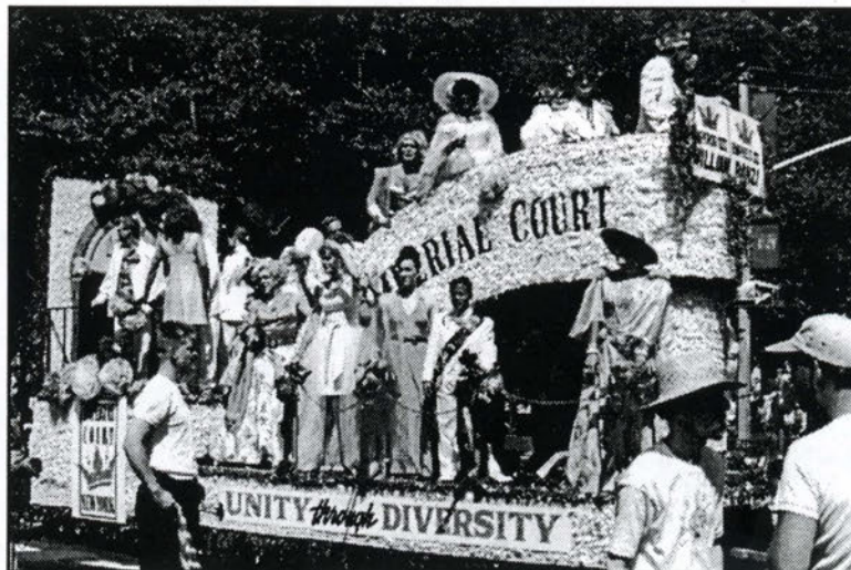
Gay Pride 1998

June 20: Rhode Island Gay Pride Parade ,