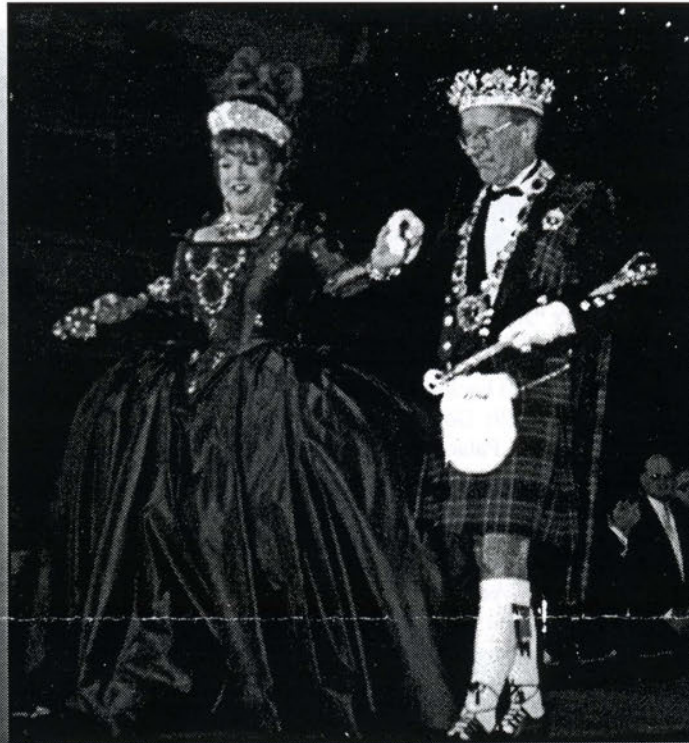
T.M.I.S.M. William VIII and Panzi XII