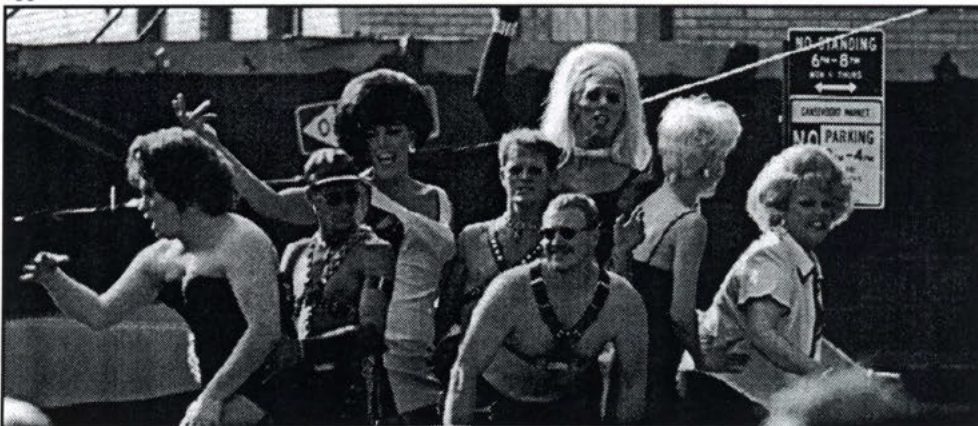
ICNY members strut their leather stuff at "Folsom Street East."

April 4: Denver, CO Coronation, attended by Empress Coco and Emperor William and Empress Panzi in their first out-of-town appearance.