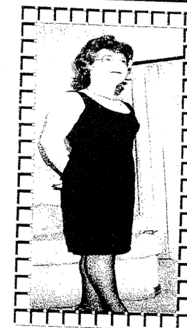
pretty low cut