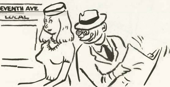
I wounder if he knows I'M a TV