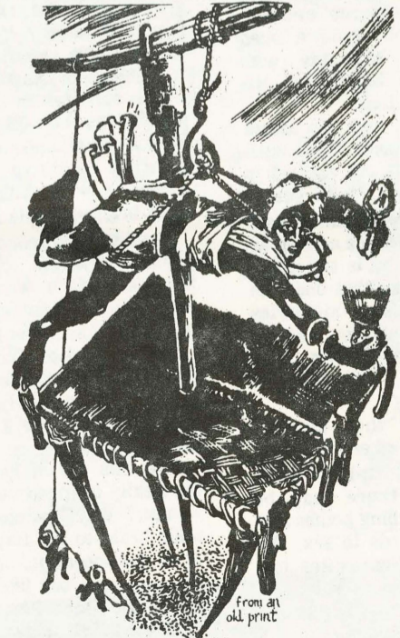
FROM AN OLD PRINT A CHILDLESS HUSBAND OF THE BHIL TRIBE OF INDIA BELIEVES HE CAN ASSURE PROGENY BY SWINGING FROM A HIGH HOOK WHILE ATTIRED IN WOMEN'S CLOTHING