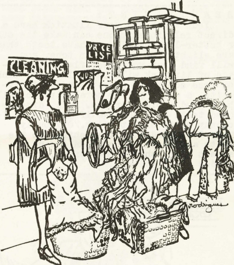
"Work shirts, work pants, socks, underwear and, on top of it all, panties, slips, bras, blouses and dresses—I'm telling you, Elaine, it's a lot of extra work being married to a transvestite."

----- "I'm having a lot of trouble placing my client at one of the studios." "moaned a Hollywood agent. "Whats the client like" asked another agent. "Got a build like Jayne Mansvilld, sings like Judy Garland and can act (cont, page 4) T