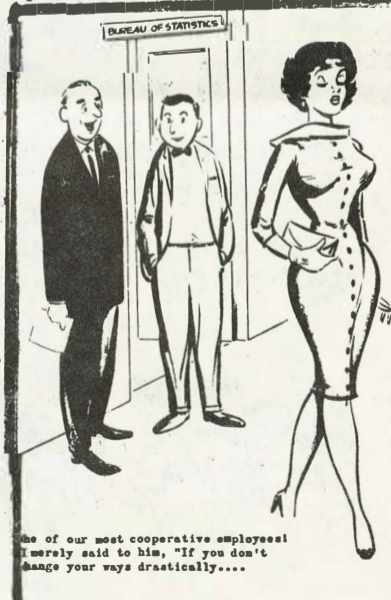
One of our most cooperative employees merely said to him, "If you don't change your ways drastically...."