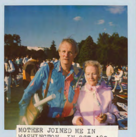
MOTHER JOINED ME IN WASHINGTON, IN OCT. 89 FOR THE LAST FULL SHOWING OF THE QUILT ON THE WHITE HOUSE LAWN.