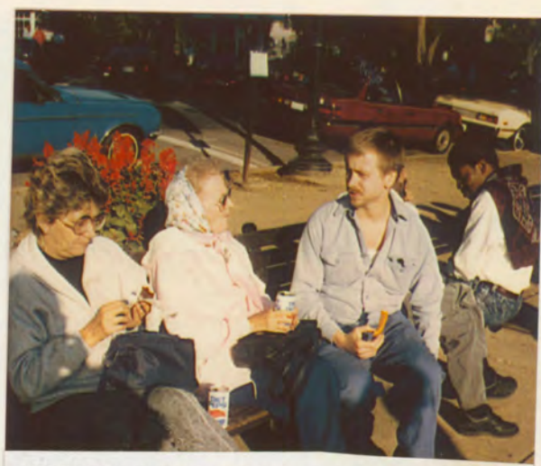
WILLIE'S MOTHER (L.) MET MINE FOR THE FIRST TIME. WE ALL VISITED THE QUILT TOGETHER.