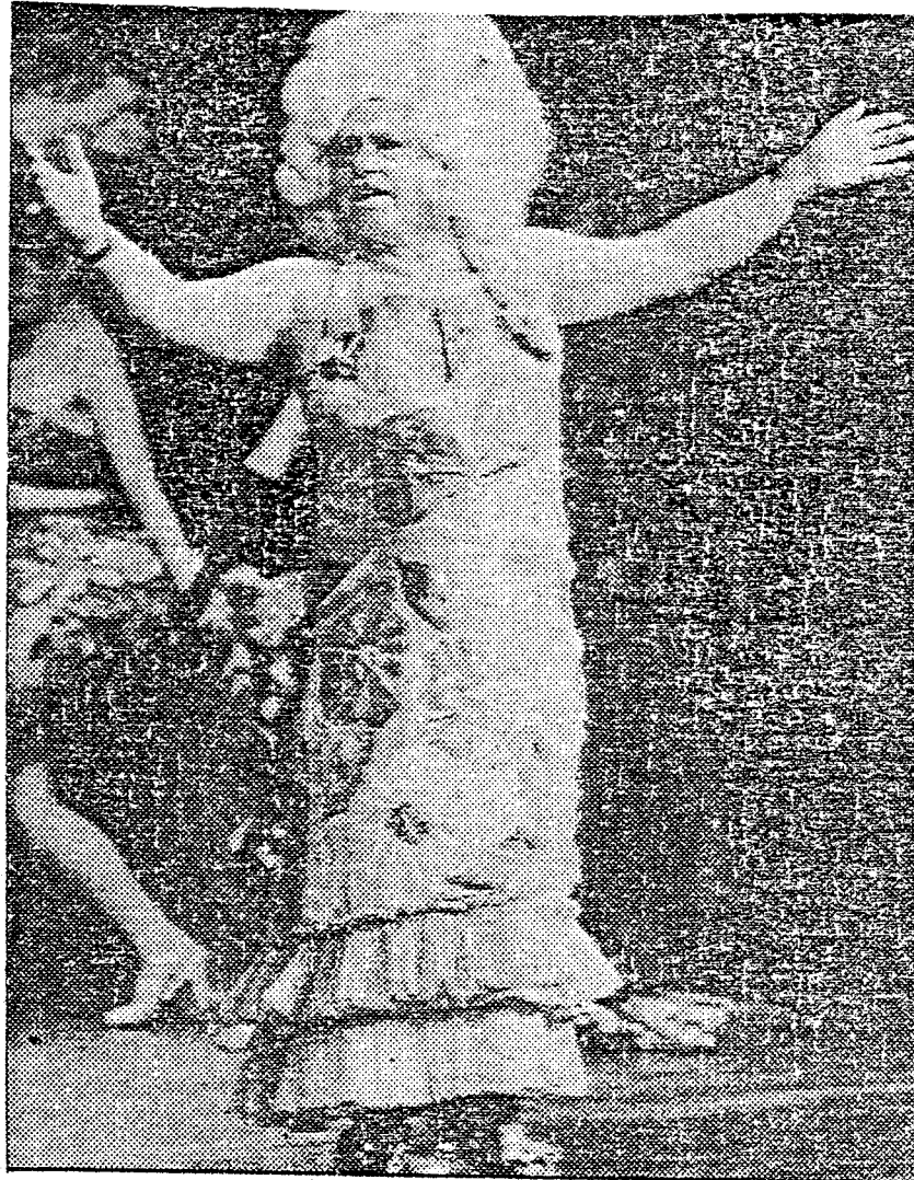
THAT'S SOME BABY