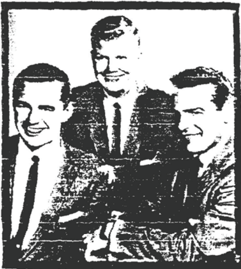
Billy Tipton (center) in the 1950's