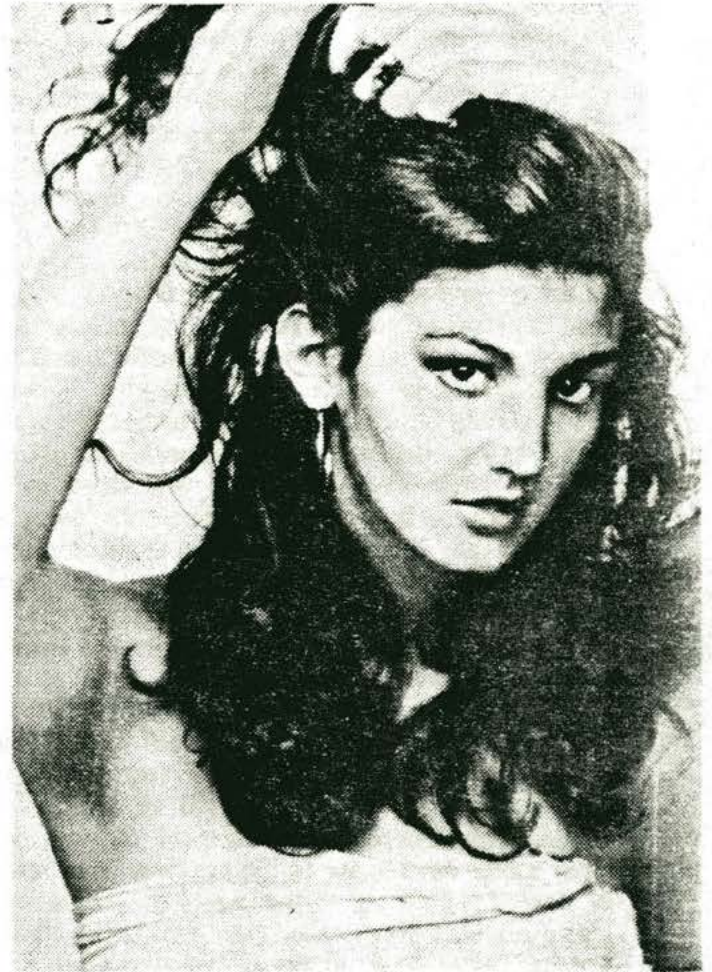
(SEE PAGE 5)