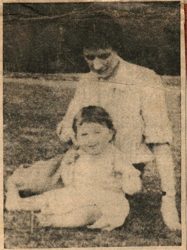
Mother and baby . . . the same two people as those in the top picture!