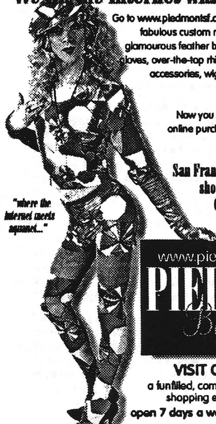
"where the internet meets glamour..."

Go to www.piedmontsf.com and you'll find all of our fabulous custom made clothing, sexy lingerie, glamorous feather boas and hats, opera length gloves, over-the-top rhinestone jewelry, affordable accessories, wigs, makeup, hosiery, shoes, EVERYTHING... ONLINE!