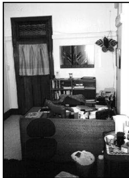
Intersex Society of New Zealand opened an office in the Pacific Ghya Center, May 1997.