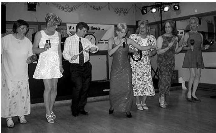
Dancing at the ITI Dinner