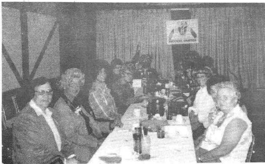
bottom left to bottom right.