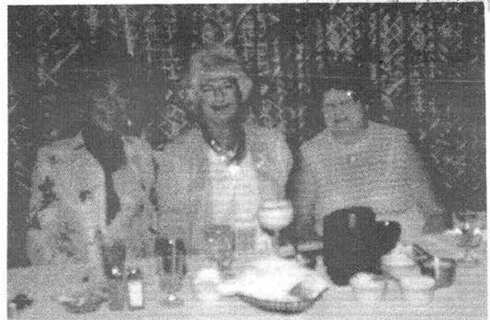
left to right