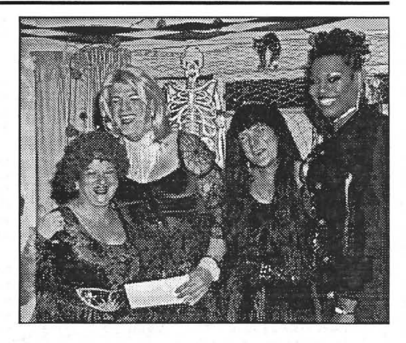
The Prez and Social Chair with Halloween Contest Winners

National Liberty Journal encourages readers to be diligent in protesting to the networks when offensive broadcasts are aired. Visit the NLJ Web site (http://www.nljonline.com/network.htm) to discover addresses, phone and fax numbers and E-mail addresses to the networks. The rapid moral decline on television will never stop until concerned viewers make their voices known to the networks and advertisers.