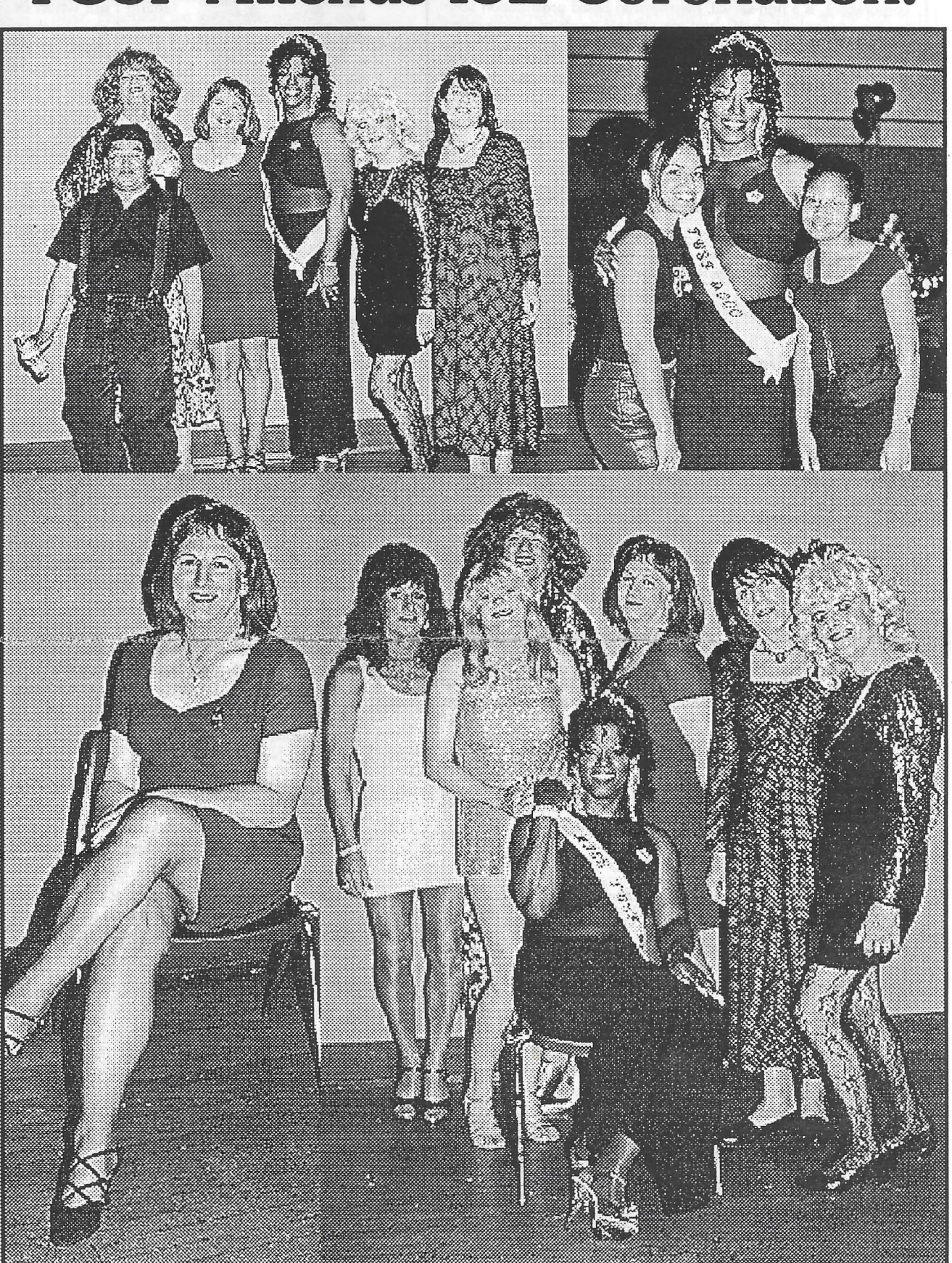
TGSF TransGender San Francisco is a group for all members of the Transgendered Community. Transgender is used as an umbrella term that includes female and male cross dressers, transvestites, drag queens or kings, female or male impersonators, intersexed individuals, pre-operative, post-operative and non-operative transsexuals, masculine females, feminine males, all persons whose perceived gender or anatomical sex may be incongruent with their gender expression, and all persons exhibiting gender characteristics and identities which are perceived to be androgynous.