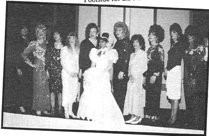
Friday Night Fashion Models.