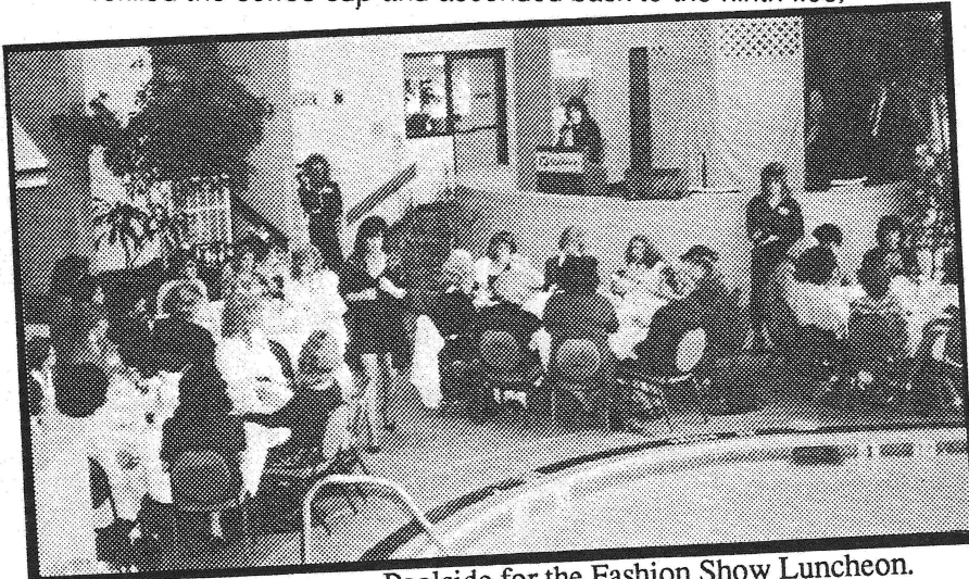
Poolside for the Fashion Show Luncheon.