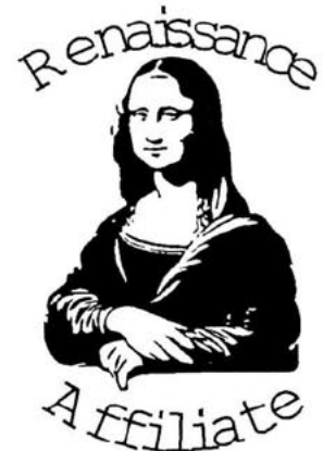
Logo for Renaissance affiliates