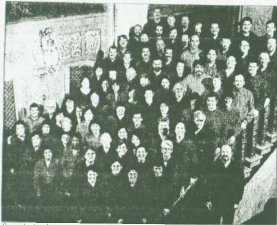
Seattle Lesbian and Gay Chorus members at the Paramount Theatre in 1996.

Add to this, the great food and drink, the marvelous ambience, decorations, and a chance to see and be seen, and my dear, you simply will not miss this one.