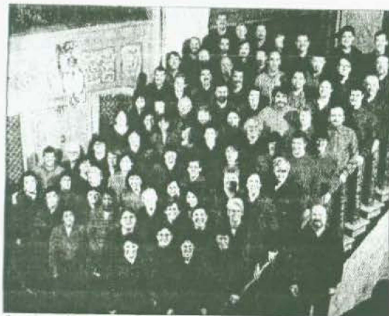
Seattle Lesbian and Gay Chorus members at the Paramount Theatre in 1996.

Add to this, the great food and drink, the marvelous ambience, decorations, and a chance to see and be seen, and my dear, you simply must not miss this one.