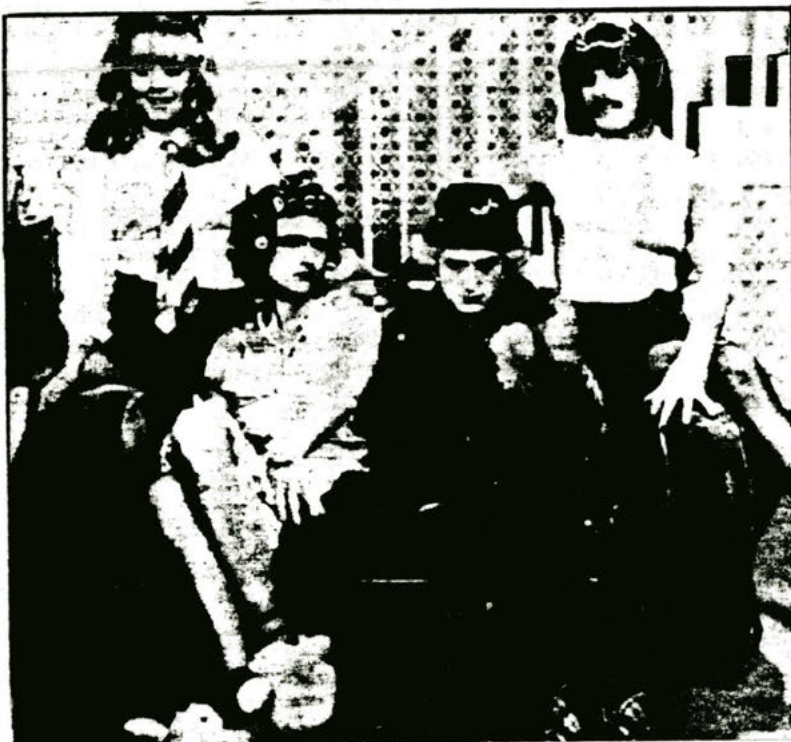
GIRLISH GA GA—Members of the Capitol group Queen slip into something more comfortable for the filming of their "I Want To Break Free" clip, the second single from the album "The Works." The Queens are, from left, Roger Taylor, Brian May, John Deacon and Freddie Mercury.

The hardest part of the weekend was late Sunday afternoon. I had to change back to my brother and this was hard to do at first. You build up within yourself such an emotional feeling that it is very hard at first to change that feeling. Plus, I had lived that whole weekend as a woman. Yet, I had to drive back to New Jersey and take care of some things. This was a weekend that I will treasure for a long time.