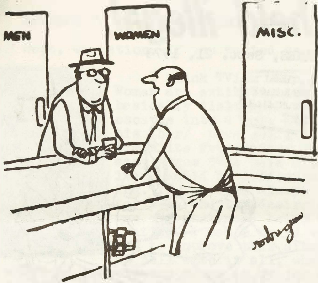
"You should see some of the characters that come in here."