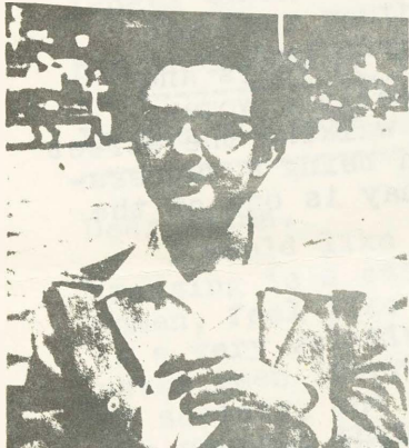
Midway in his treatments, he poses for his first picture in women's garb