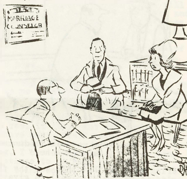
"He's got my old dress, but that's not good enough!"