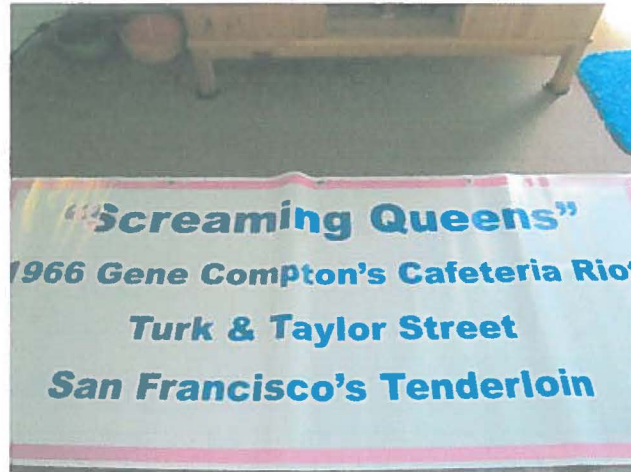
Banner for 1966 Gene Compton's Cafeteria Riot

This Banner was shown at Trans March 2012 at the Senior and Youth brunch.