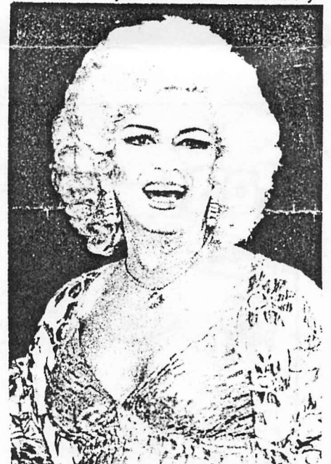
Female Impersonator Extrordinaire

TAKE A WALK ON THE WILDSIDE, INC. 620 Jarvis St # 2312, Toronto, Ont., Canada M4Y 2R8 416 864-0420