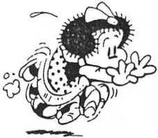
© 1990 United Feature Syndicate, Inc.