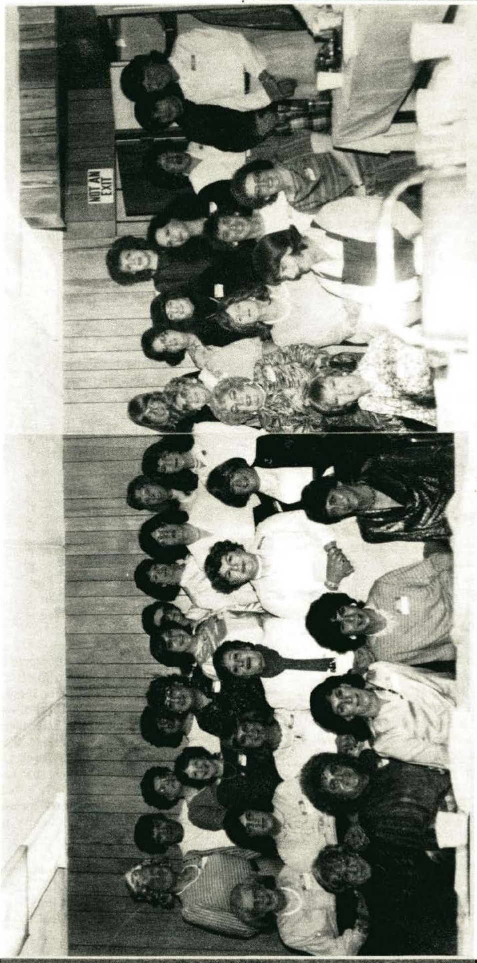
CHI DELTA MU CHAPTER MEETING, APRIL 1985