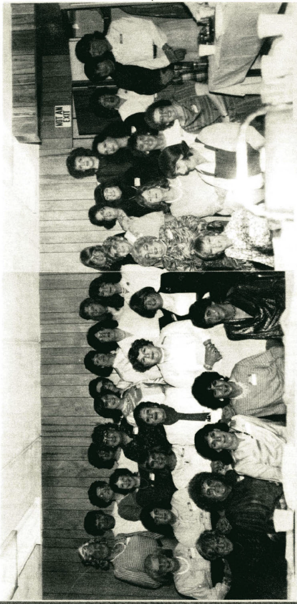
CHI DELTA MU CHAPTER MEETING, APRIL 1985