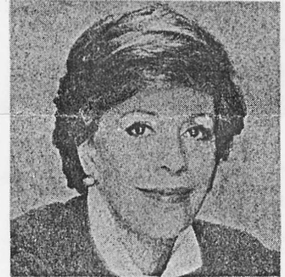
Carol Burnett: She's a he who returns home.