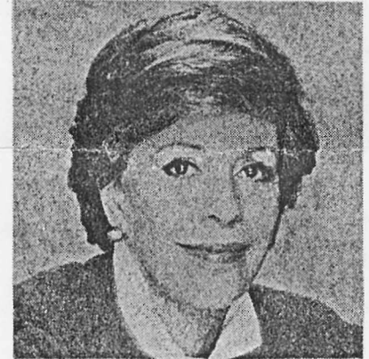
Carol Burnett: She's a he who returns home.