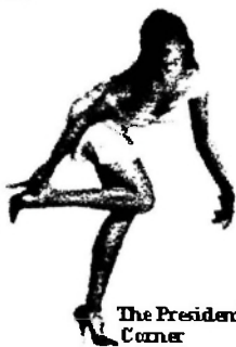
The President's Corner

From the President's Diningroom in downtown Hull, Quebec.