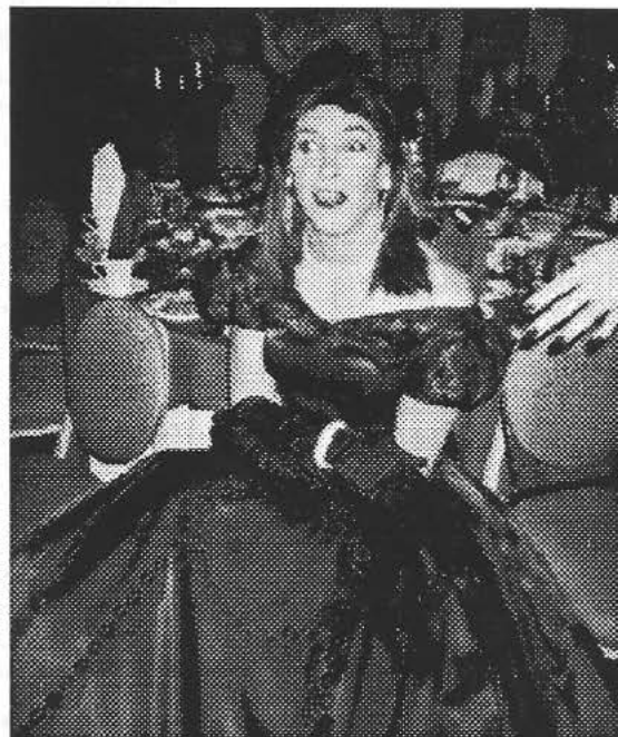
(Ed Note: From the looks of the photo, every penny was well spent - she looks absolutely ravishing!)

With the preliminaries out of the way, we began planning my costume. She made it seem so natural and comfortable to discuss my style, colors, fabric and trim details. I was happy to find what I wanted would be on sale at the fabric stores. Being able to discuss the frills and detail that I wanted for such a