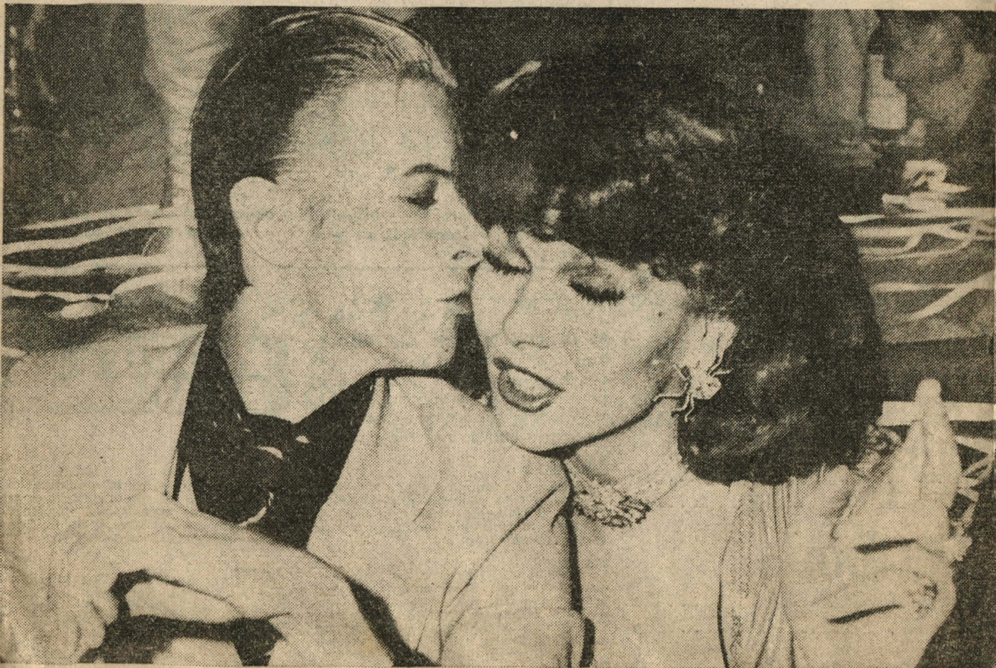
KISSING: Bowie and drag queen Romy Haag getting together in the early hours of the morning at a Paris night club.

But on hearing of her revelations he said: "The whole thing is hysterically funny. I will have a wonderful time suing Mr. Haag."