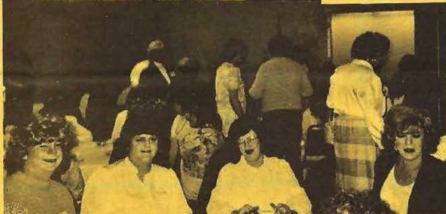
PHOTOS FROM THE I.F.G.E. CONVENTION

***** ★ ★ MEMBERSHIP RENEWALS DUE JUNE 1 ★ ★ ★ All memberships in ETVC, regardless of when ★ purchased, need to be renewed as of June 1, ★ 1987 at the annual rate of $10.00 for a full ★ year of fun and good friendship. ★ *****