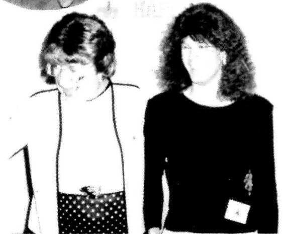
Would you believe former teacher and former student!