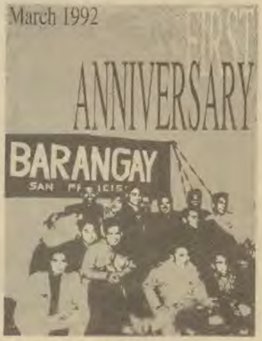
Barangay is the monthly magazine of the Filipino gay male community.