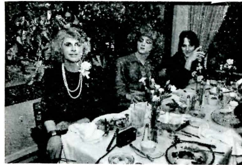
It's late at night and the girls are going assertive during a house discussion.