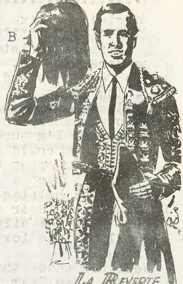
LA REVERTE WAS BILLED FOR YEARS AS SPAIN'S ONLY FEMALE BULL-FIGHTER OF THE PERIOD. BUT IN 1908, WHEN WOMEN BULLFIGHTERS WERE BARRED FROM THE RING BY A NEW LAW, LA REVERTE DOFFED HER WIG AND REVEALED SHE WAS ACTUALLY A MASQUERADING MAN

%/%/%/%/%/%/%/%/%/%/%/%/%/%/%/%/%/%/%/%/%