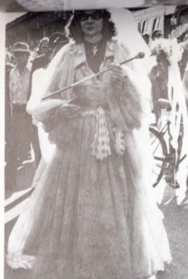
Rollerina. A Village landmark and the maid of honor.