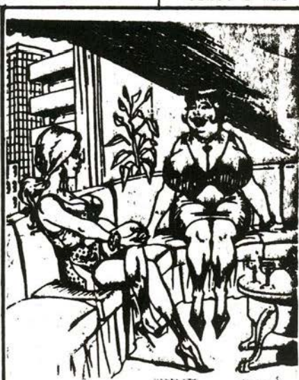
"Darling, I'm so glad you like me dressing like a woman."

Since I didn't fit in well, I became a loner. I felt guilty over the way I felt and finally began to put any thought that bothered me out of my mind.