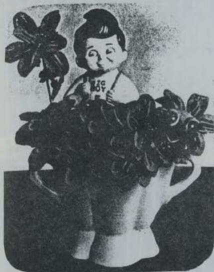
a) a boy & his frog