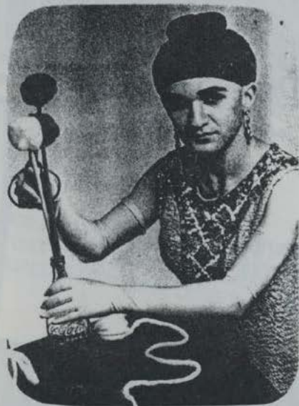
c) fall fizzle!

B) Flower arranging can be a spiritual exercise: making offerings to the gods on a regular basis is a thoughtful way to express thanks. This arrangement pays homage to the rich bounty of the oceans and to our heritage as sea creatures. Here, Mexican paper blossoms fill a mermaid's bowl. The miniature flags ($1.50 each - United Nation's gift shop) represent the nations of the world who benefit from sea-faring trade.