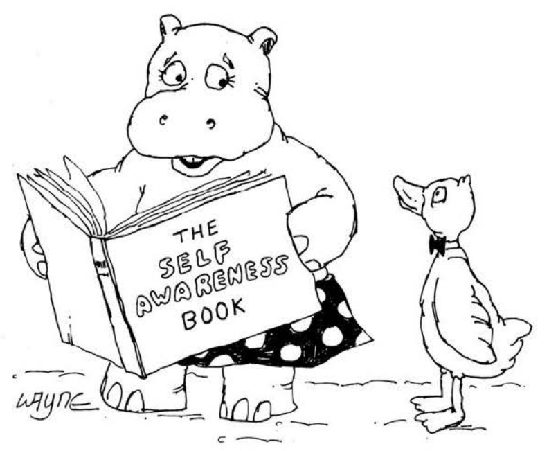
"Good grief! I'm a hippo!"

Do any of you readers have a possible solution for my problem? Please send your suggestions to the Phoenix so the Staff can send them on to me.