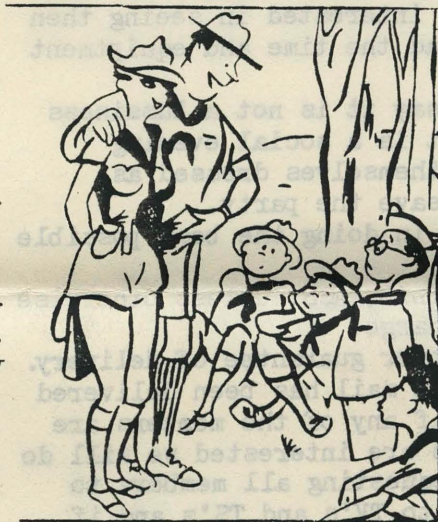
"BOYS, THIS IS A NEW MEMBER OF THE TROOP. HE'S GOING ALONG ON THE CAMPING TRIP."