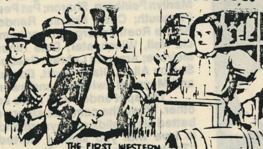
THE FIRST WESTERN CRIPPLE CREEK BARROOM THE EARLIEST KNOWN WESTERN FILM, WAS MADE IN 1898, LASTED BUT ONE MINUTE, HAD NO ACTION— AND THE ROLE OF A BARMAID WAS PLAYED BY A MAN