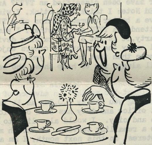
"LETS SEE IF SHE CAN TELL WHICH ONE OF US ARE THE HUSBANDS."