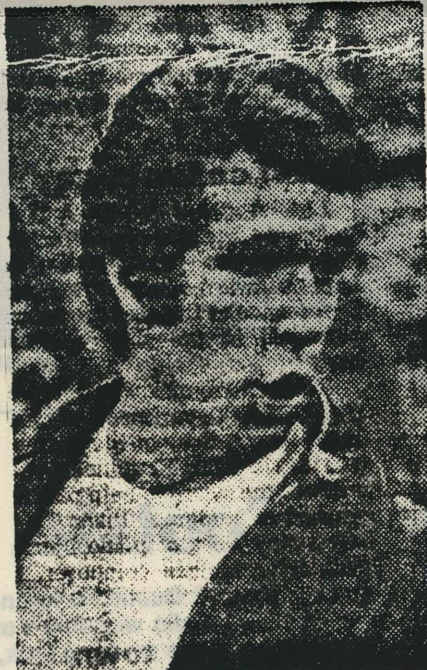
Winkler as The Fonz.

I suggest that you and your husband talk to a therapist. It is important that you understand his aberrant behavior and not alienate the lad or make him feel like a freak.