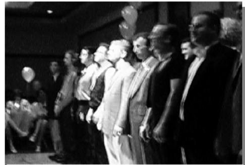
30 members of the 80 member Chicago Gay Men's Chorus