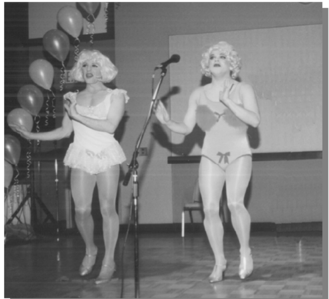
A performance by members of the Chicago Gay Men's Chorus