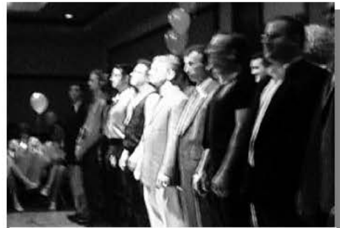
30 members of the 80 member Chicago Gay Men's Chorus