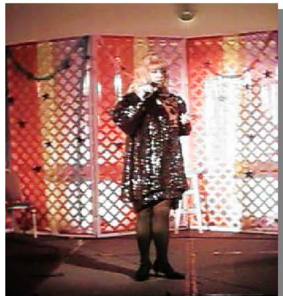
Honey West as MC for the Gong show.