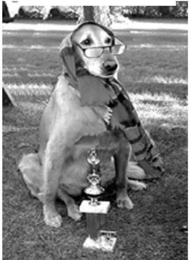
The official picnic security dog Protecting the trophy.