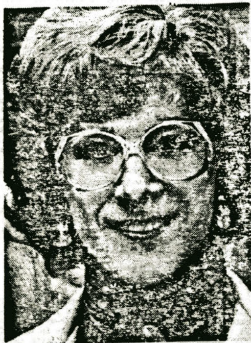
"Tootsie," starring Dustin Hoffman, was the most-watched film on HBO in '84.