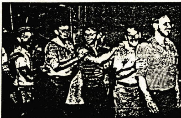
Men's like: Dancing at last week's National Conference on Men and Masculinity