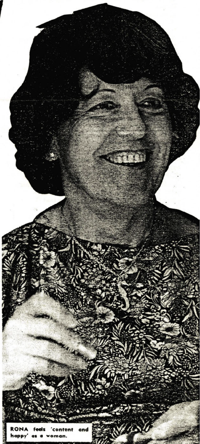
RONA feels 'content and happy' as a woman.