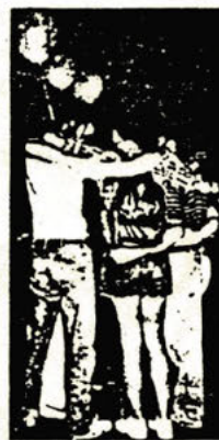
Hugs: Transcending macho?

Meanwhile, across the hotel lobby, an Amway convention was in full swing. Amway attendees, guessing that the men embracing down the hall must be part of a gay-rights conference, began speculating in their auditorium on the abomination of homosexuality. But their guess on the orientation of those at the men's meeting was generally wrong. At one of the NOCM workshops, two-thirds of the participants said male-female love relationships were their most pressing problem.