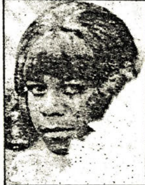
FLIP as GERALDINE

Flip Wilson and Geraldine open at Westbury tomorrow.