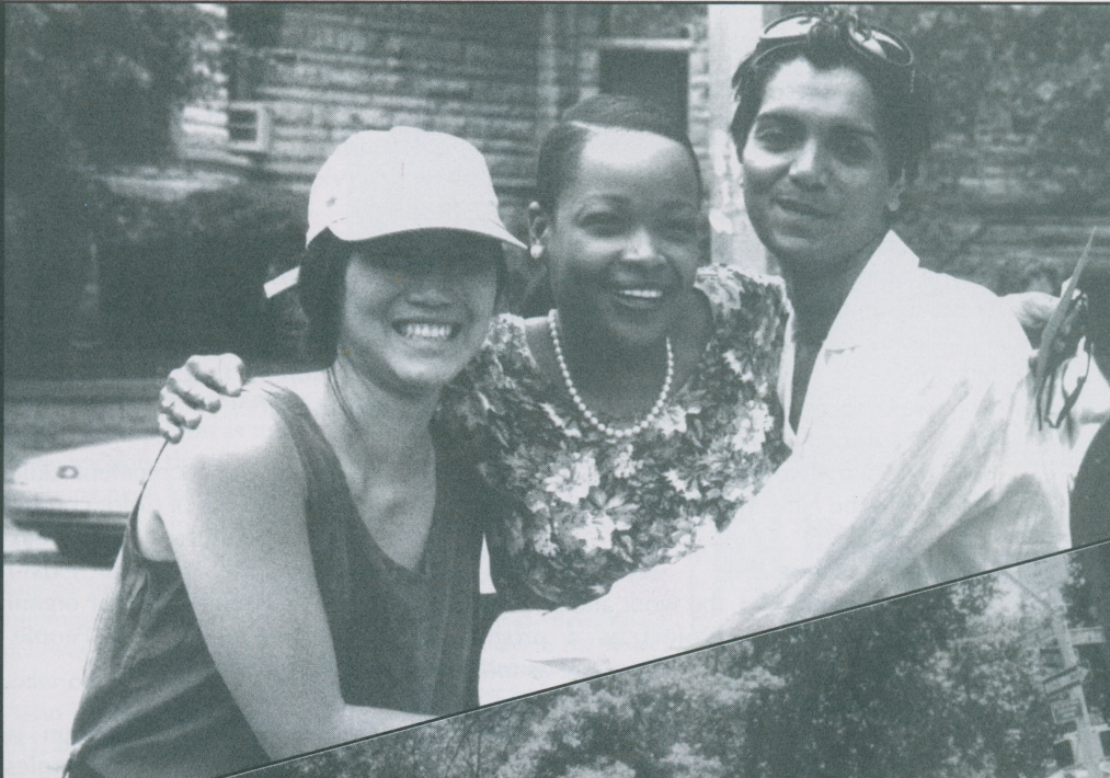
ALP AT LAST YEAR'S BROOKLYN & MANHATTAN PRIDE MARCHES!

JUNE 7, JACKSON HEIGHTS, QUEENS. 6TH ANNUAL LESBIAN & GAY QUEENS PRIDE PARADE AND MULTI-CULTURAL FESTIVAL. MARCH BEGINS AT 12:30PM, DOWN 37TH AVENUE TO 75TH ST. FESTIVAL BEGINS AT NOON AND ENDS AT 6:30PM, ON 37TH RD FROM 73RD TO 77TH ST.