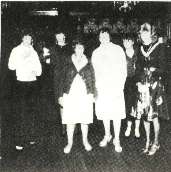
Another scene at the Club in Johannesburg