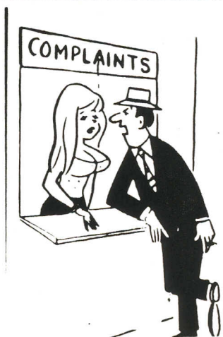
"You see Mr Brown, that brand of hormones didn't work nearly as well for me as they did for you!"